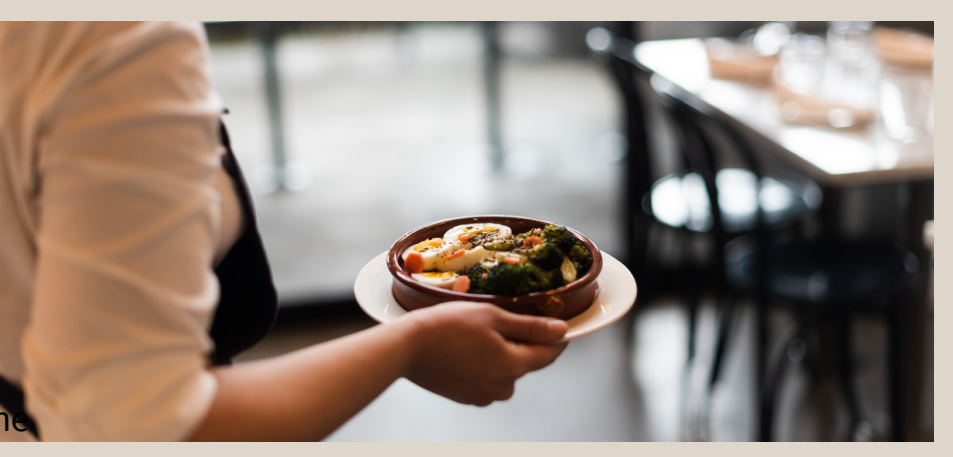
The front of house staff serving customer and carrying plates