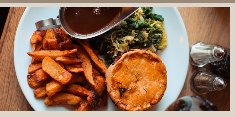
One of our delicious home made shortcrust pies