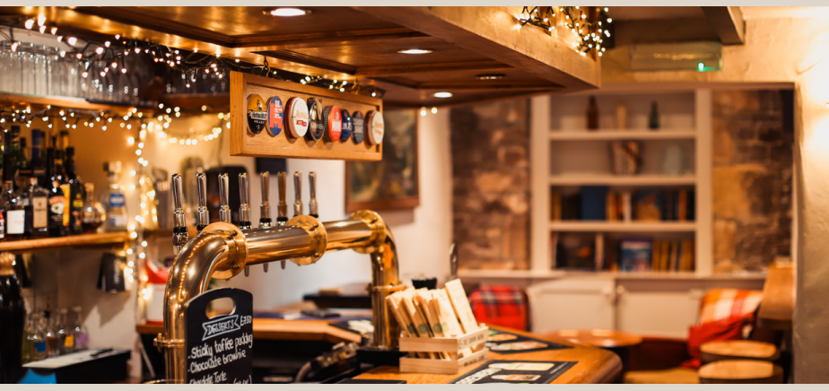
People sat around the bar and drinking area, ordering drinks and chatting