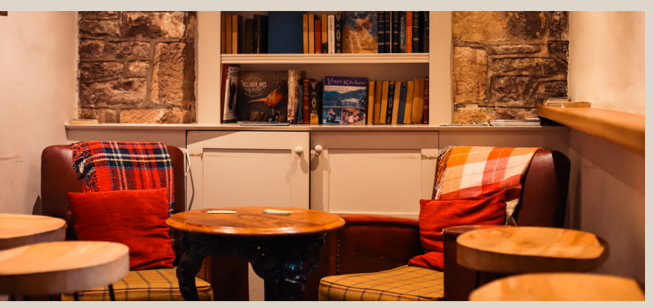
The soft comfortable texture of our cosy furnishings