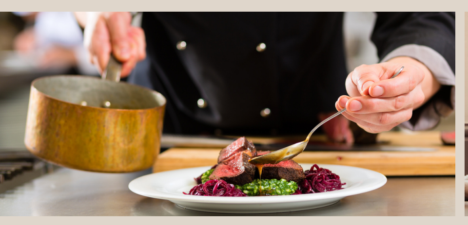
The sound of the chefs talking and cooking in the kitchen