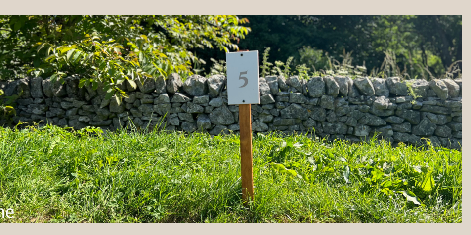
The Royal Oak has a family friendly campsite in the grounds with grass pitches