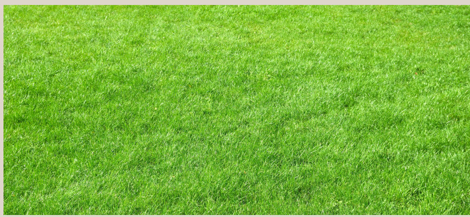
The feeling of the grass and plants in the garden