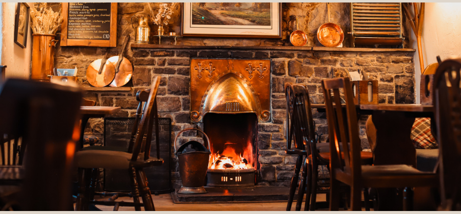
The Royal Oak is a cosy country pub