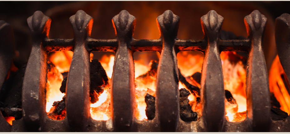
The heat from a cosy fire when its cold outside