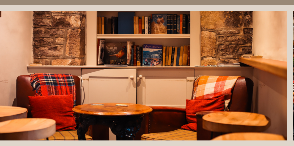
The cosy interiors and traditional fireplace