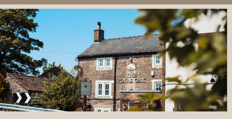
The wind blowing through the trees and birds tweeting whilst sitting outside in the garden