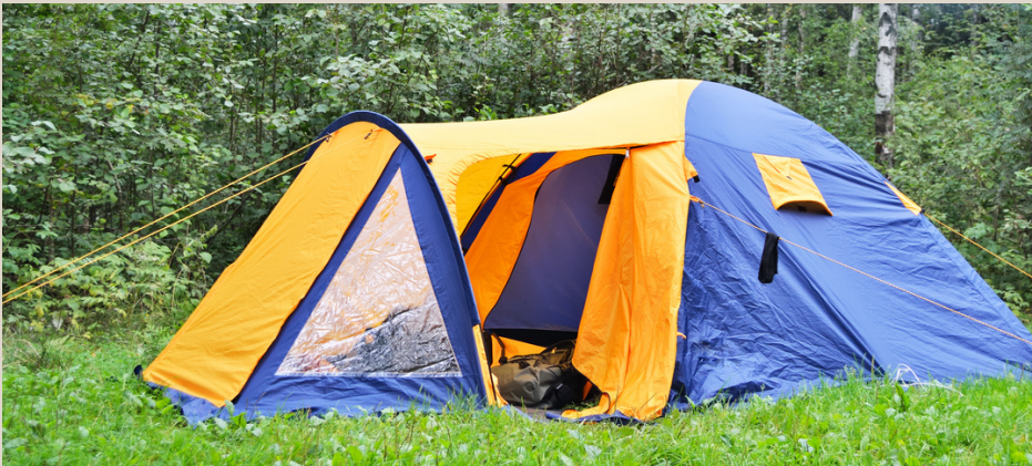
Tents & camper vans pitched up on the camp site