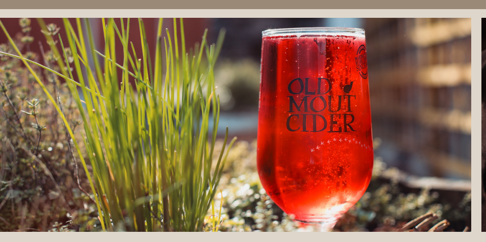
The feeling of a cold glass from a freshly poured drink