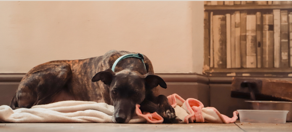
The sound of dogs barking outside or in the pub.