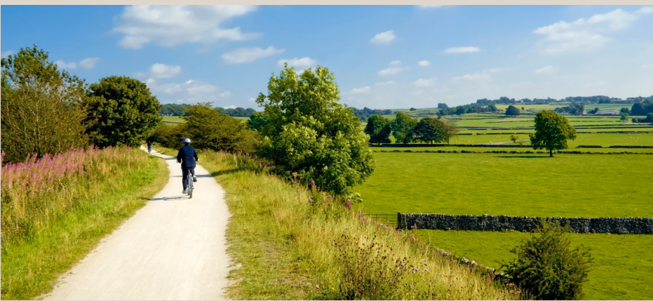
The Royal Oak is on the Tissington & High Peak walking and cycling trails