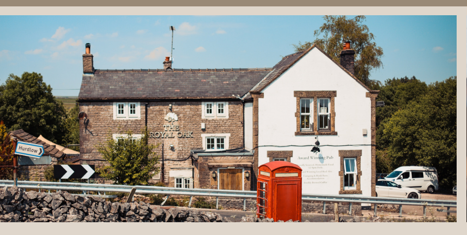
This sensory story will help me know what to expect when I visit the Royal Oak